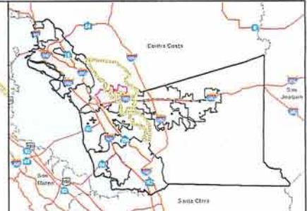
Alameda County Reference Map