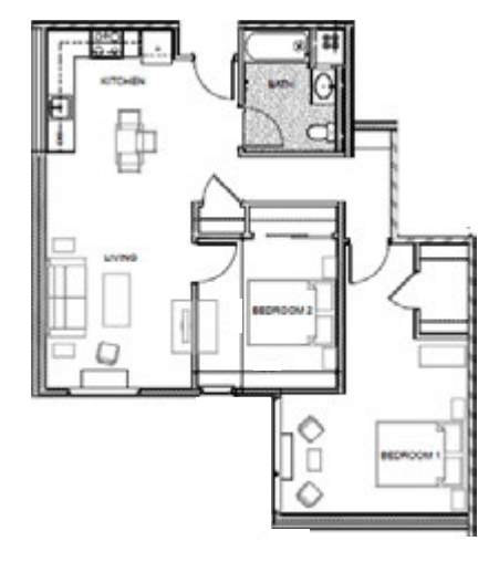
Two Bedroom One Bath Approx. 880 sq. ft.