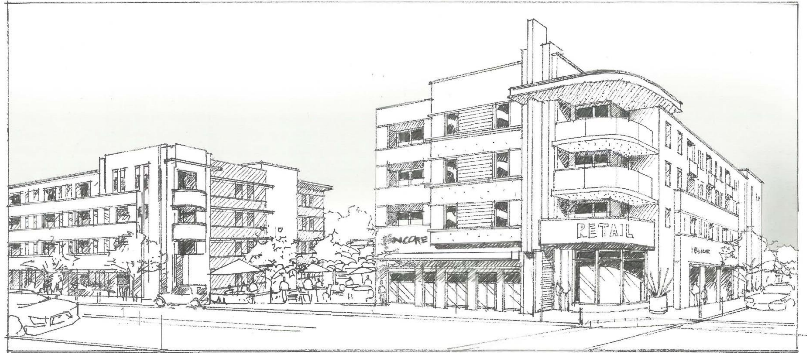
PERSPECTIVE VIEW FROM HESPERIAN BLVD AND PASEO GRANDE

Developer meeting with San Lorenzo community to gather feedback/input