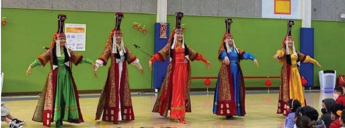
Image below is a picture of the Mongolian Dancers performing during the Alameda County Lunar New Year Celebration on January 30th at the Lincoln Recreation Center in Oakland's Chinatown.

The Clerk-Recorder's Office is available to help with language translation services during our regular business hours (Monday-Friday, 8:30am-5:00pm). For help over the phone, customers can call us at (510) 272-6362 , extension 3.