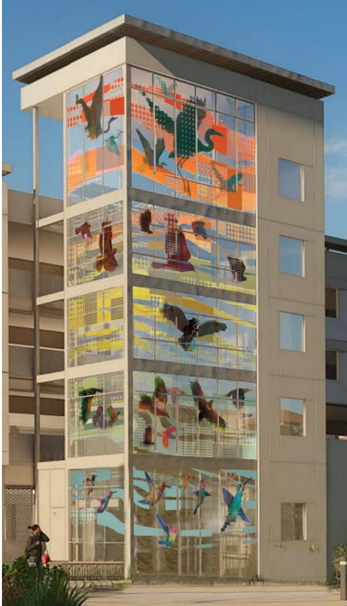
Building image provided by McCarthy Building Companies.