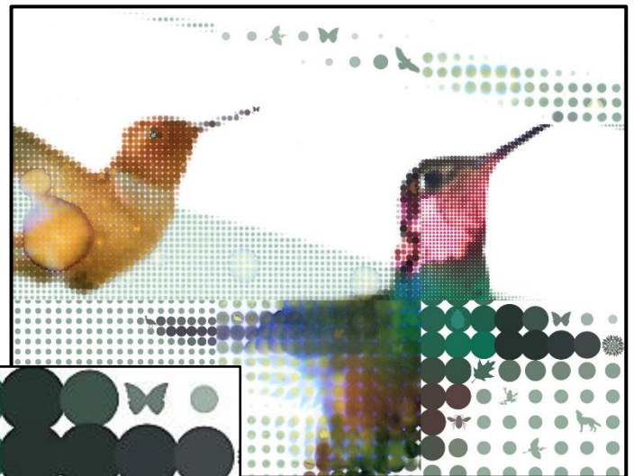
Close up image of hummingbirds and the smaller dots found within the overall images featuring animals, birds, insects and plants.

At the request of the Selection Committee, artist Phillip Hua worked on a revised design. The new design features a different bird on each floor including: hummingbirds, northern flickers, great horned owl, red-tailed hawks, and egrets. These birds replace the originally proposed depiction of geese. Some fine tuning of the bird selection may take place. Additionally, colored patterns were added to the transparent areas providing a sense of movement and adding visual interest and texture to the overall design.